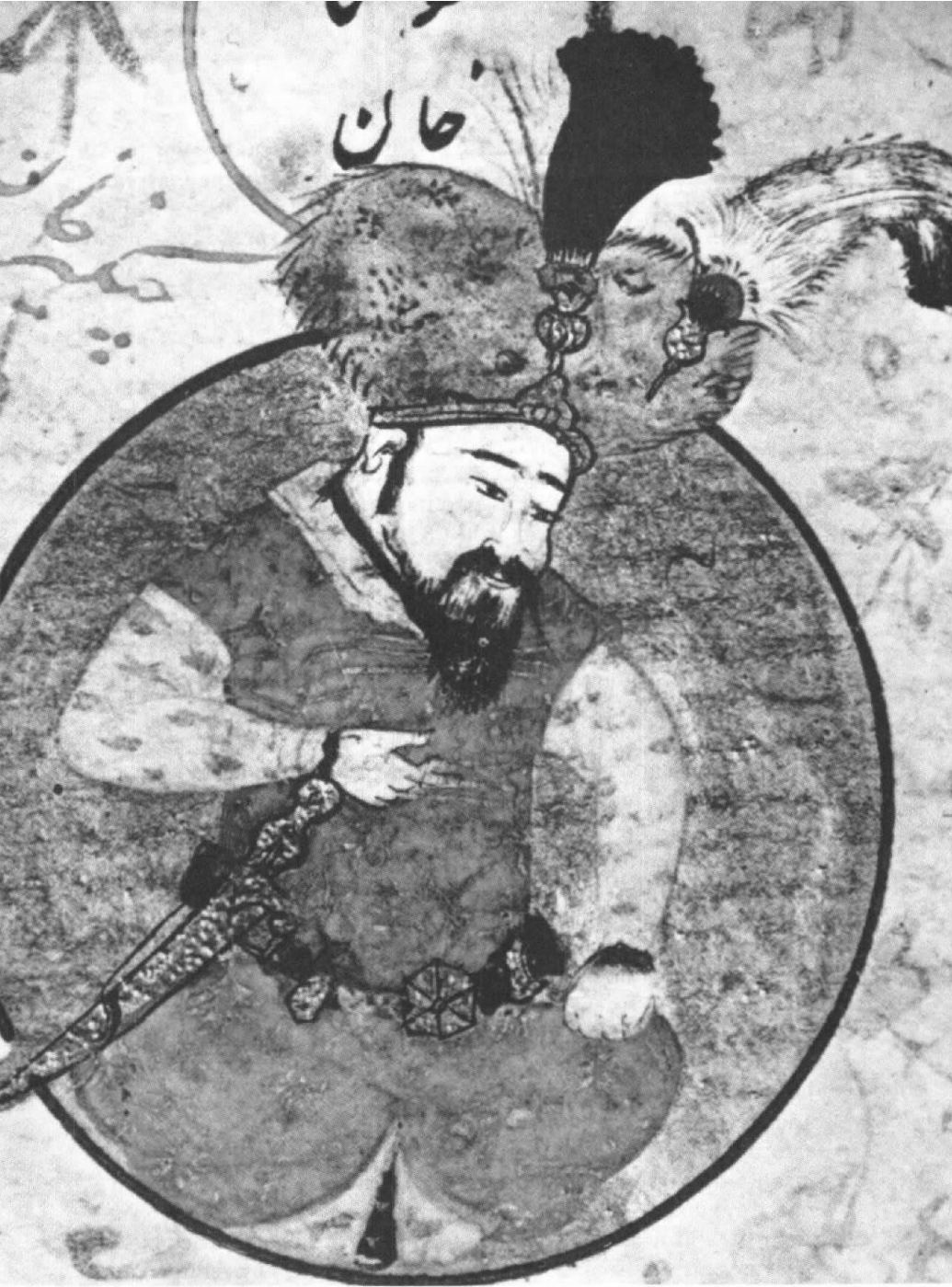
Chinggis Khan, detail from a sixteenth-century Iranian genealogical manuscript