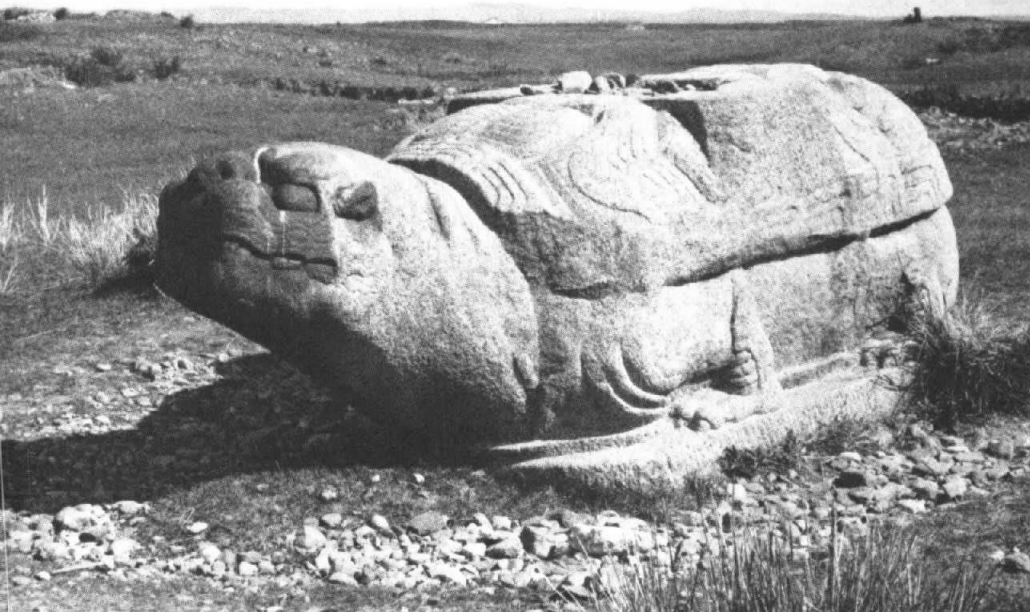
Stone turtle marking the reputed site of Chinggis Khan's capital at Karakorum

the Genoese fortress of Sudak on the southeastern coast, then turned north into what later became known as the Ukraine.